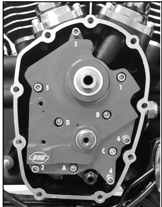
Picture 3: Cam Support Plate Screws (1-6) and Oil Pump Screws (A, B, C, D)