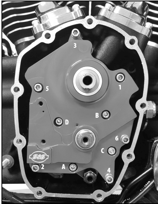
Picture 3: Cam Support Plate Screws (1-6) and Oil Pump Screws (A, B, C, D)