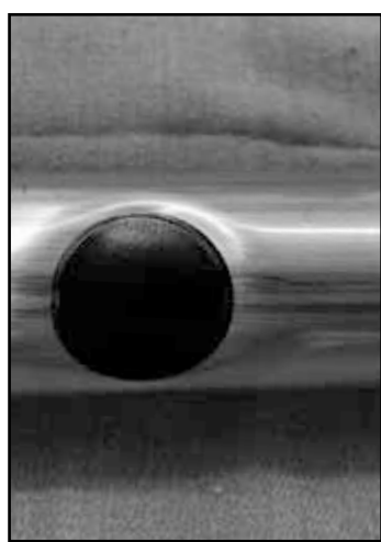
Figs. 1 & 2

4. Install two clamp pieces (4 and 5) onto crossover tube. Insert carriage bolt, but do not tighten at this time, to allow left to right adjustment of the clamp.