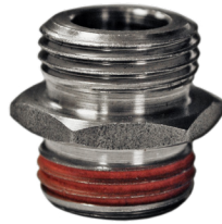
Stock-to-Jagg oil filter nipple