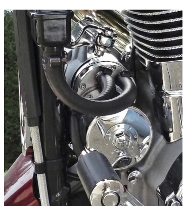
This mounting orientation may be required on some Sportster models

some Sportster models may require rotating the mounting of the 4701 offset oil filter adapter 180 degrees, placing the hoses above the filter (see photo at right). In these installations, the anti-rotation device is not required, and you may now skip to step 16.