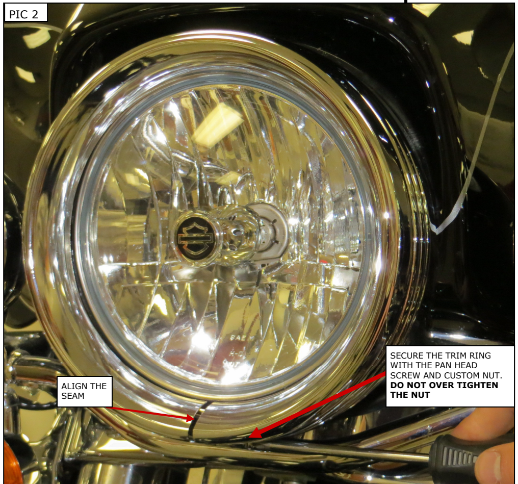
PIC 2 ALIGN THE SEAM